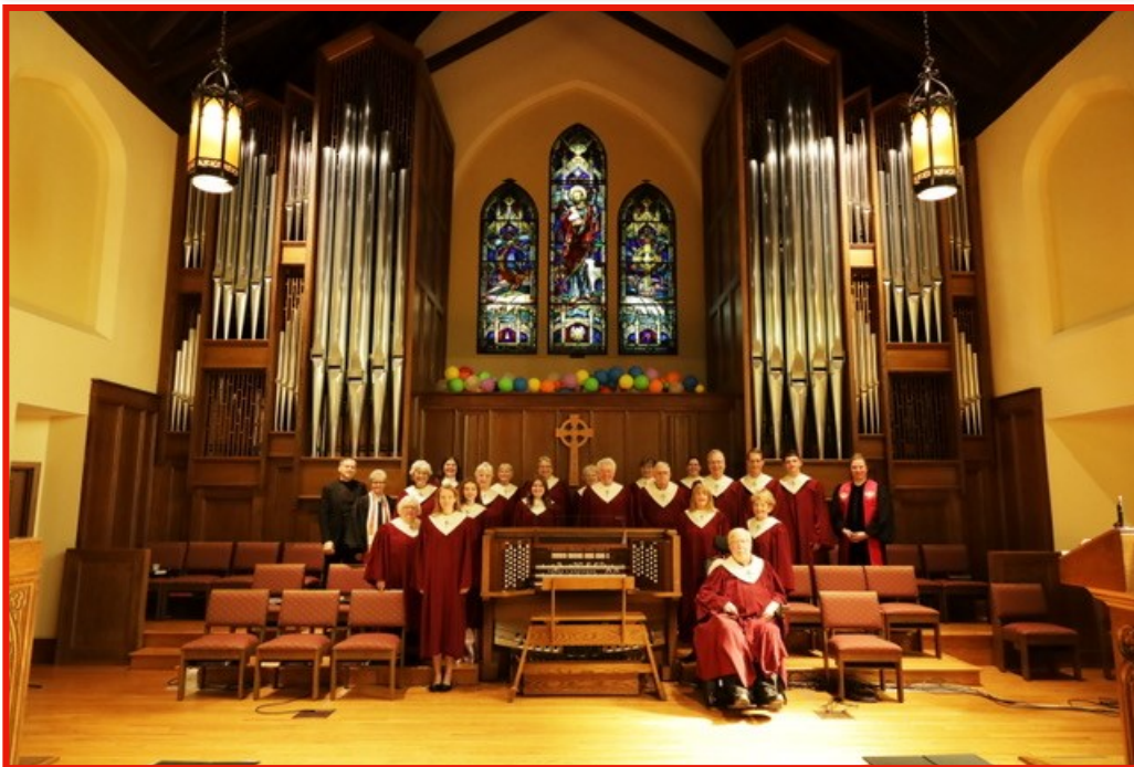
Both the CHPC Handbell Choir and the Chancel Choir welcome new members to join their ranks and “make a joyful noise unto the Lord.”