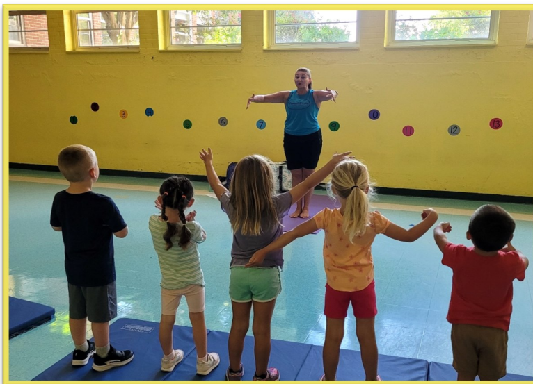
Summer camp activities this year included time spent in the Bike Room practicing yoga and enjoying an inflatable bounce house and slide. CHPC's Preschool was busy all summer with camps and other events happening nearly every week.