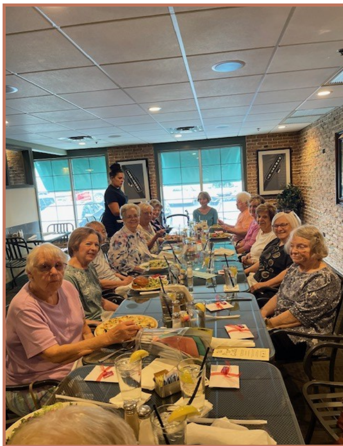
More than 15 women attended the Dorcas Circle's July luncheon at the Pizza Grille, filling one of the restaurant's dining areas with faith, fun, and friendship courtesy of CHPC!