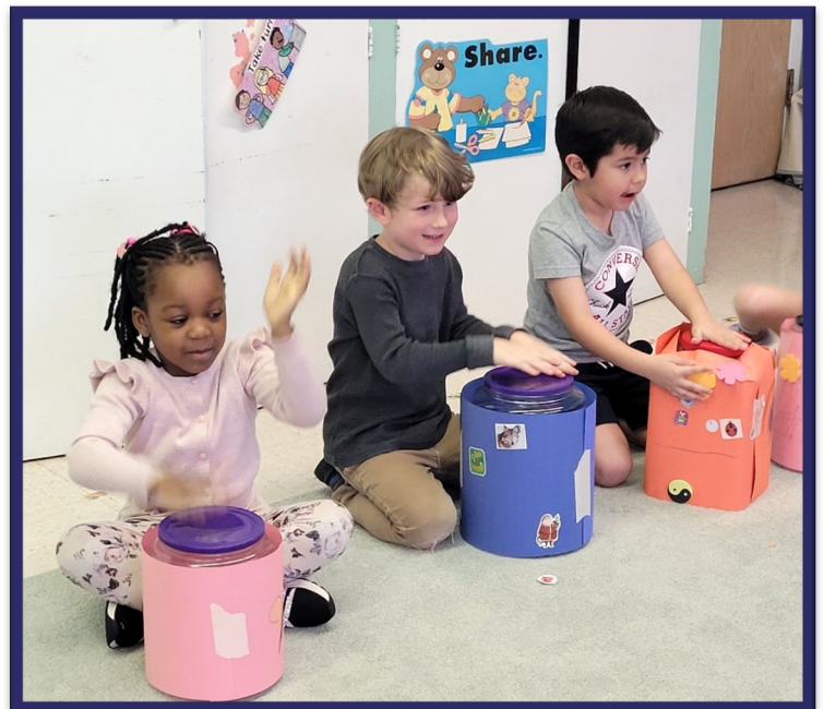
Preschoolers have been making projects and learning to play their own handcrafted instruments as they prepare for spring events like the annual CHPC Preschool Art Show and an end-of-year music program.