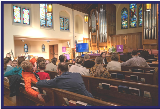
Families gather for ARISE on a recent Sunday morning. All are welcome at the 8:30 a.m. informal worship service.

CHPC's new Sunday morning worship offering, ARISE: A Family Service, enters its third month of gathering.