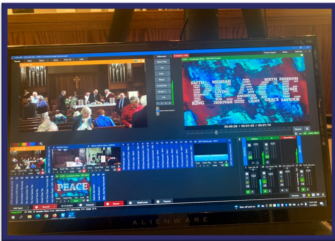
The console used to run CHPC's weekly livestreamed service.

Did you know that CHPC has a portable broadcast studio?