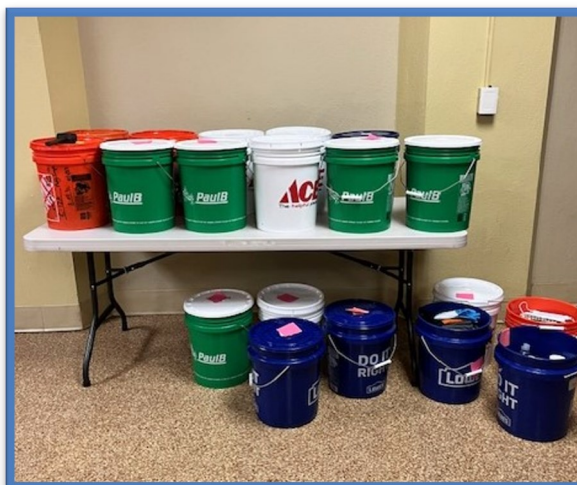
During October, CHPC's children made handprint angels on a heart-shaped sign, at left, to support Homeland Hospice's 15th anniversary. Also in October, volunteers used donations from preschool families and the congregation to pack cleaning supply buckets, at right, for those affected by Hurricane Helene.