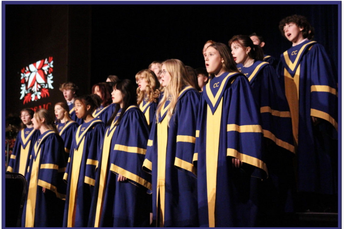
The Cedar Cliff High School Chamber Singers perform numerous times throughout the winter and spring seasons, featuring a predominantly a cappella repertoire. In addition to the group’s December performance at CHPC, their busy touring schedule this year includes several venues in the Harrisburg area and a culminating trip to Walt Disney World in April.