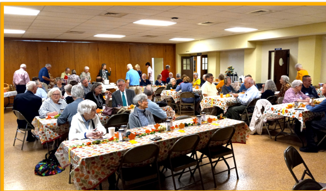
More than 50 women and men attended the PW Fall Gathering on Oct. 6 in Fellowship Hall. The theme of the event was "Harvest Gratitude," and funds were raised to support housing for homeless veterans.